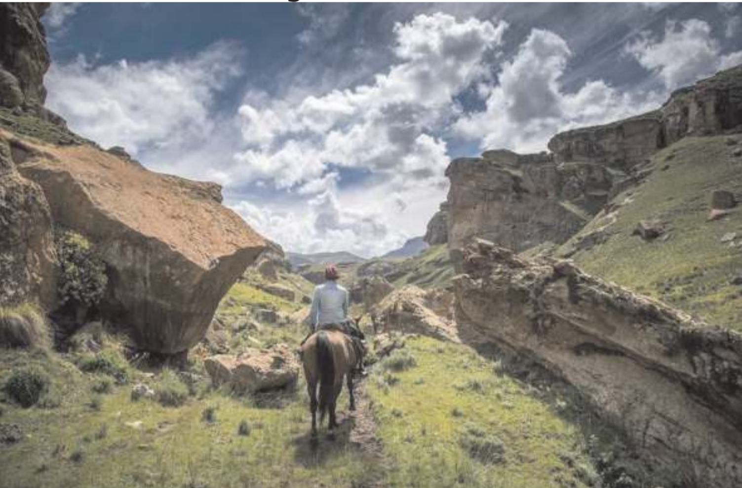
I spotted this photo hanging up on the verandah at the backpackers at Khotso on the Drakensberg Gardens road and it immediately made me realise what the front page headline for this edition should be. For Horse riding or tubing with Khotso go to info@khotso.co.za or 082 412 5540