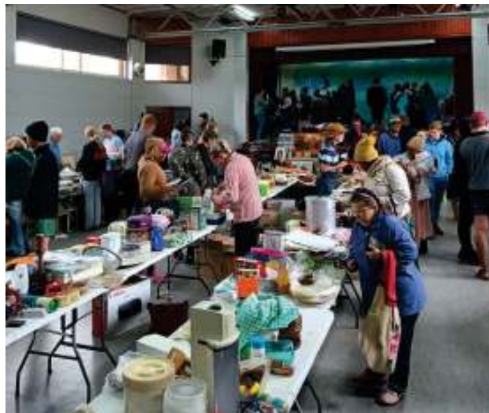
The white elephant market was held in the School hall